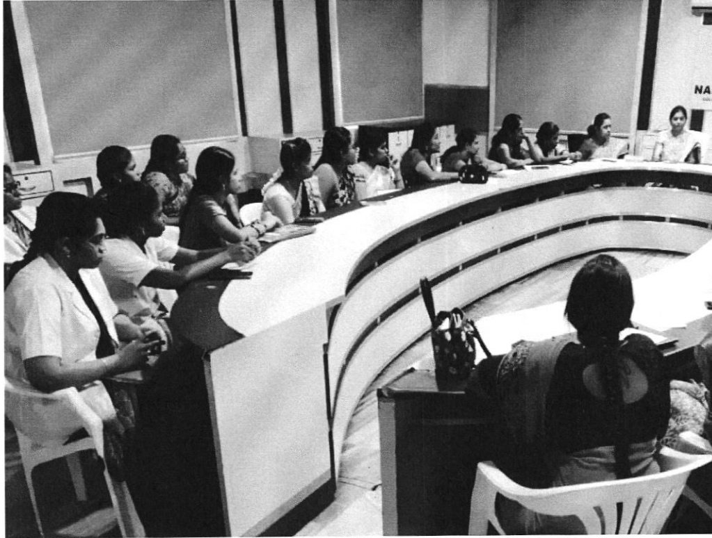
Training on capability enhancement (15.10.2019)