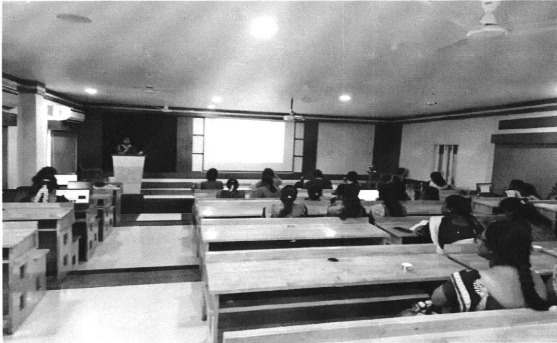
Orientation on mentor- mentee (08.7.2019)