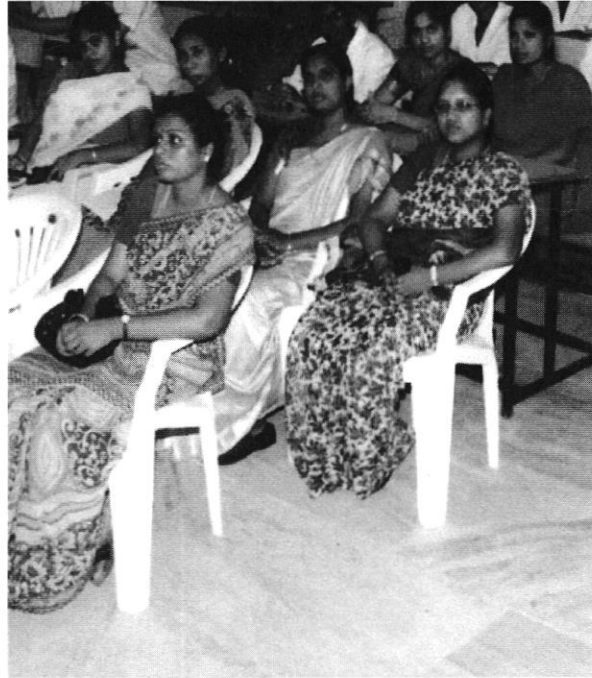
Workshop on Bio Medical Waste Management (01.02.2020)