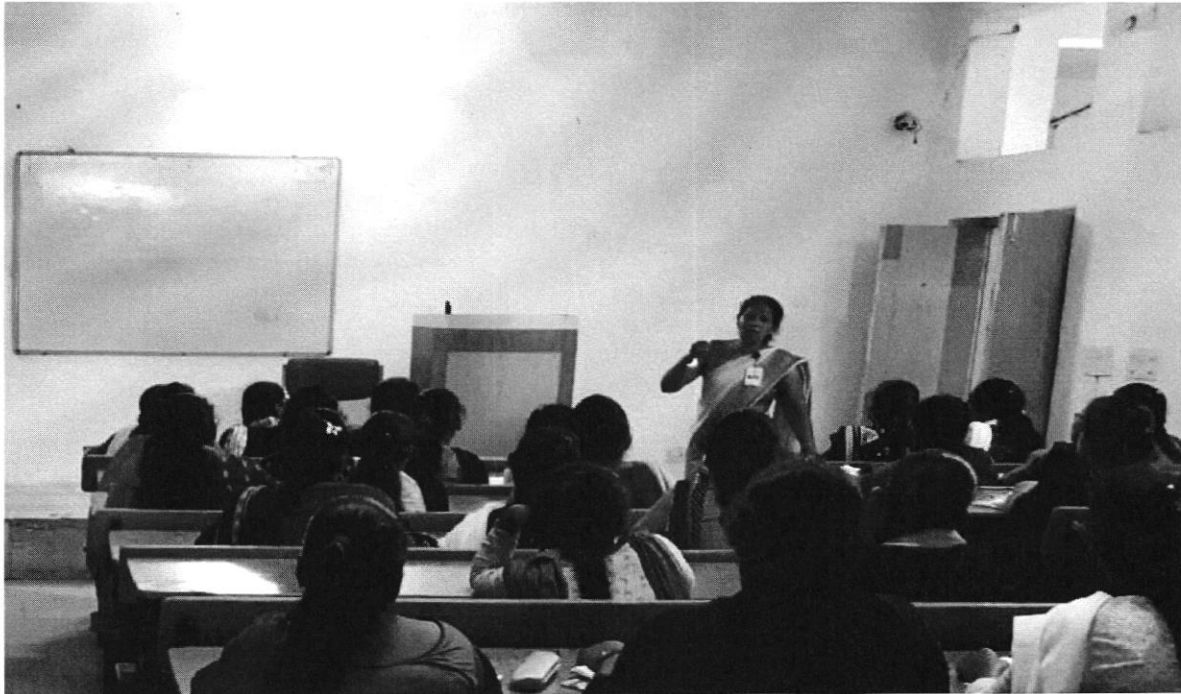
Awareness program on Feedback Mechanism (28.06.2019)