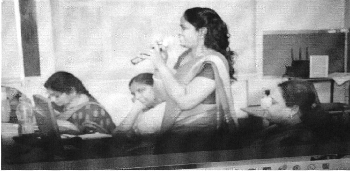
Workshop on Issues and challenges in Nursing education (14.08.2019)